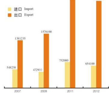
近几年进出口状况 Importing & Exporting in the latest years 单位: 万美元 Unit: 10 thousand USD

绍兴已形成了工业为主、民营经济为主体的经济结构形态，具有承接国际先进制造业转移的基础条件。有纺织化纤、机械电子、医药化工、食品饮料、节能环保等优势产业。+